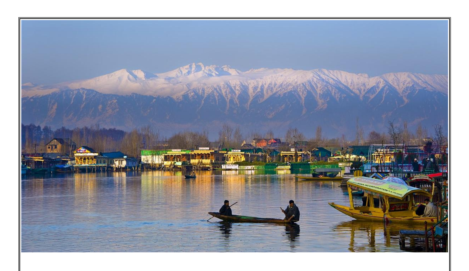
Golfing in "Heaven on Earth" – Kashmir (Pahalgam & Srinagar)